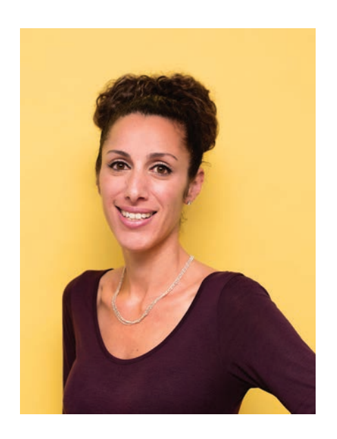
"WE HAVE TO SHOW OUR TALENT FOR PROJECT- PLANNING THE WORK SO THEY CAN CONTINUE TREATING PATIENTS."

Willmott Dixon is working with Mace on the P23Procure framework, an alliance that brings together two of the UK's largest privately owned contractors to collaborate on how best to serve NHS trusts.