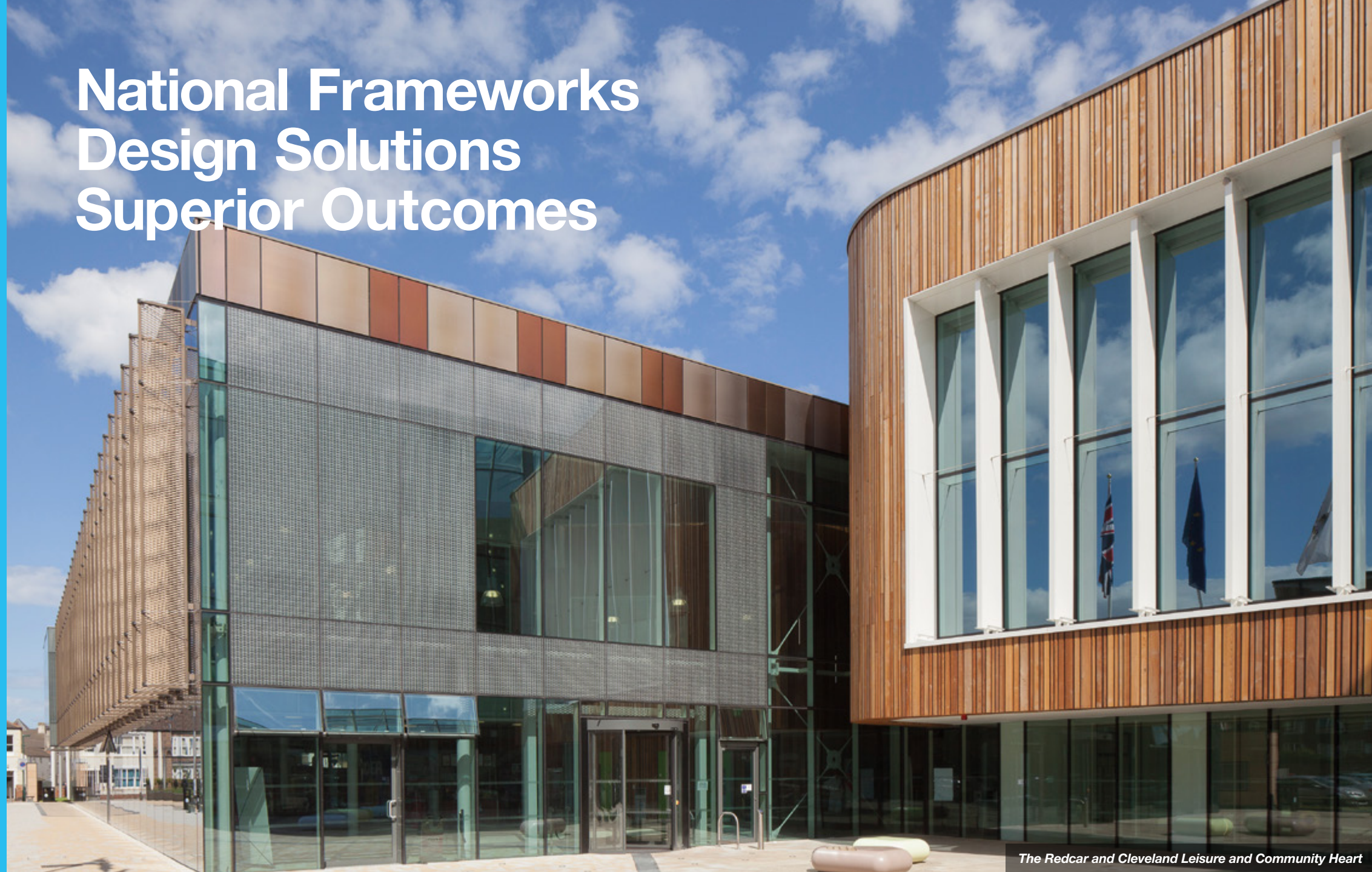
The Redcar and Cleveland Leisure and Community Heart